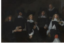
Regents of the Old Men's Alms House

about 1664, Oil on canvas, 172.3 × 256 cm