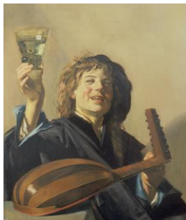
The Merry Lute Player

The National Gallery, London. Bought 1980 (NG6458)