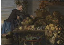
Frans Hals and Claes van Heussen Young Woman with a Display of Fruit and Vegetables