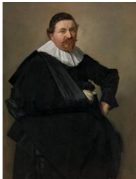
Portrait of Lucas de Clercq

about 1635, Oil on canvas, 121.6 × 91.5 cm