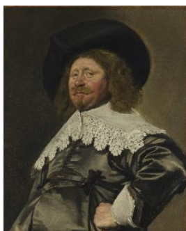
Portrait of a Man, possibly Nicolaes Pietersz Duyst van Voorhout

English Heritage, The Iveagh Bequest (Kenwood, London)