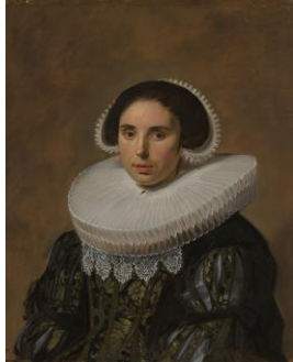
Portrait of a Woman