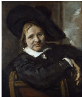
Portrait of a Man in a Slouch Hat

about 1660, Oil on canvas, 79.5 × 66.5 cm