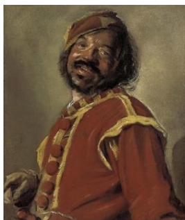
Pekelharing (The Merry Drinker)

Musée du Louvre, Paris, Paintings Department (MI 926)