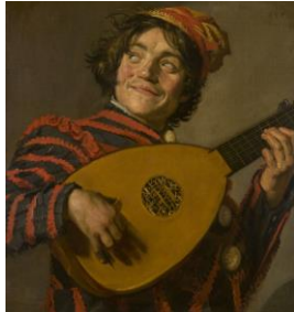
The Lute Player about 1623, Oil on canvas, 70 × 62 cm Musée du Louvre, Paris, Paintings Department (RF 1984 32) Selected literature