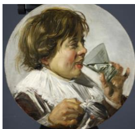
Laughing Boy with a Wine Glass