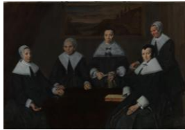
Regentesses of the Old Men's Alms House

about 1664, Oil on canvas, 170.5 × 249.5 cm