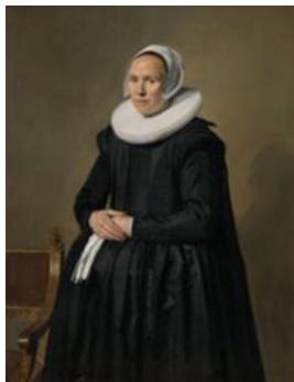
Portrait of Feyntje van Steenkiste

Rijksmuseum, Amsterdam. On loan from the City of Amsterdam, 1891 (SK-C-556)