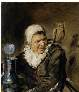
Malle Babbe about 1640, Oil on canvas, 78.5 × 66.2 cm Staatliche Museen zu Berlin, Gemäldegalerie