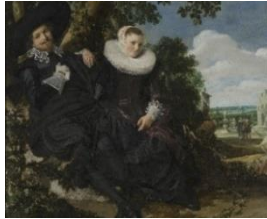
Portrait of a Couple, probably Isaac Abrahamsz Massa and Beatrix van der Laen

about 1622, Oil on canvas, 140 × 166.5 cm