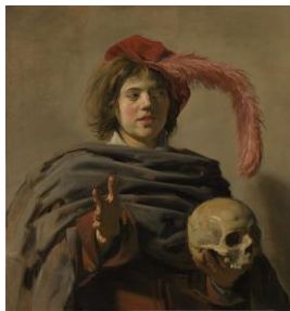
Young Man holding a Skull (Vanitas)

Staatliche Schlösser, Gärten und Kunstsammlungen Mecklenburg- Vorpommern, Schwerin