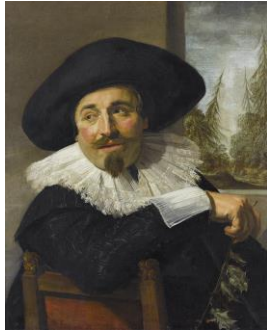
Portrait of Isaac Abrahamsz Massa