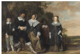
Family Group in a Landscape

Staatliche Museen zu Berlin, Gemäldegalerie