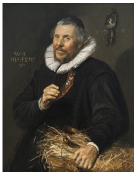
Portrait of Pieter Cornelisz van der Mersch

1616, Oil on canvas, transferred from panel, 87.5 × 69.2 cm