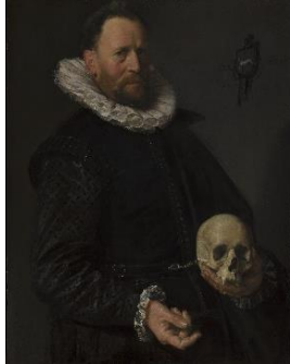
Portrait of a Man holding a Skull