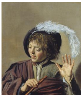
Boy with Flute about 1627, Oil on canvas, 68.8 × 55.2 cm Staatliche Museen zu Berlin, Gemäldegalerie