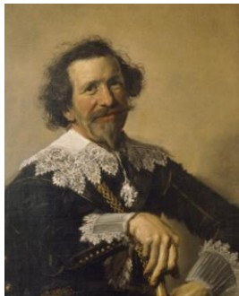
Portrait of Pieter van den Broecke