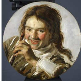
Laughing Boy with a Flute