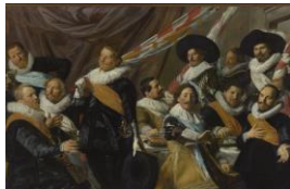
Banquet of the Officers of the St George Civic Guard

about 1627, Oil on canvas, 179 × 257.5 cm