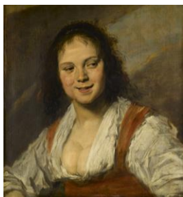
Young Woman (‘La Bohémienne’)