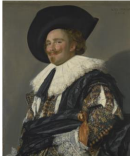
The Laughing Cavalier