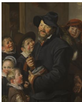
The Rommel- Pot Player about 1620, Oil on canvas, 106 × 80.3 cm Kimbell Art Museum, Fort Worth, Texas