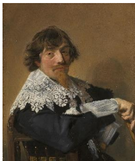
Portrait of a Man

The Cleveland Museum of Art, Leonard C. Hanna Jr. Fund (1999.173)