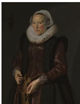
Portrait of a Woman standing

Rijksmuseum, Amsterdam. On loan from the City of Amsterdam, 1891 (SK-C-557)