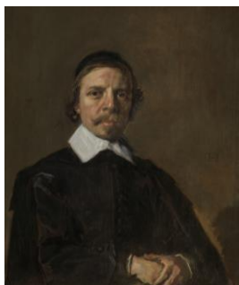
Portrait of a Man, possibly a Clergyman