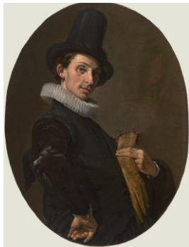
Portrait of a Young Man holding a Pair of Gloves