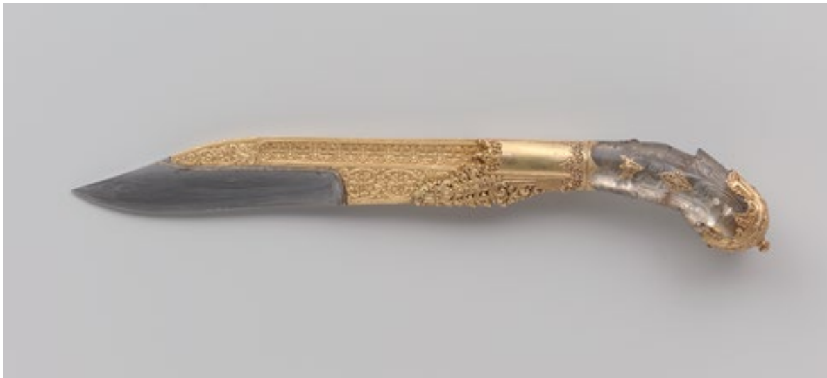
Photo 1: Kandyan knife. (Rijksmuseum, Amsterdam, inv.no. NG-NM-7114).

The pihiya , recorded as NG-NM-7114, has an engraved crystal hilt set with gold. Two-thirds of the blade is covered with elegantly worked gold. The wooden sheath is embossed with a golden plate, the edges are decorated with filigree, ending in a curl in the bottom. 1 The length of the knife is 29,5 cm. The Colombo National Museum has assessed 75 similar types of knives in their museum collection, and shows that NG-NM-7114 stands out by its crystal handle, the usage of gold and its decoration. 2 This is also the case for the four Kandyan knives that are at present in the collection of the Royal Asian Art Society in The Netherlands (on loan in the Rijksmuseum), as well as in the collection of the Dutch National Museum of World Cultures: these are all of a coarser type than NG-NM-7114, both with regard to the craftsmanship and material used. 3