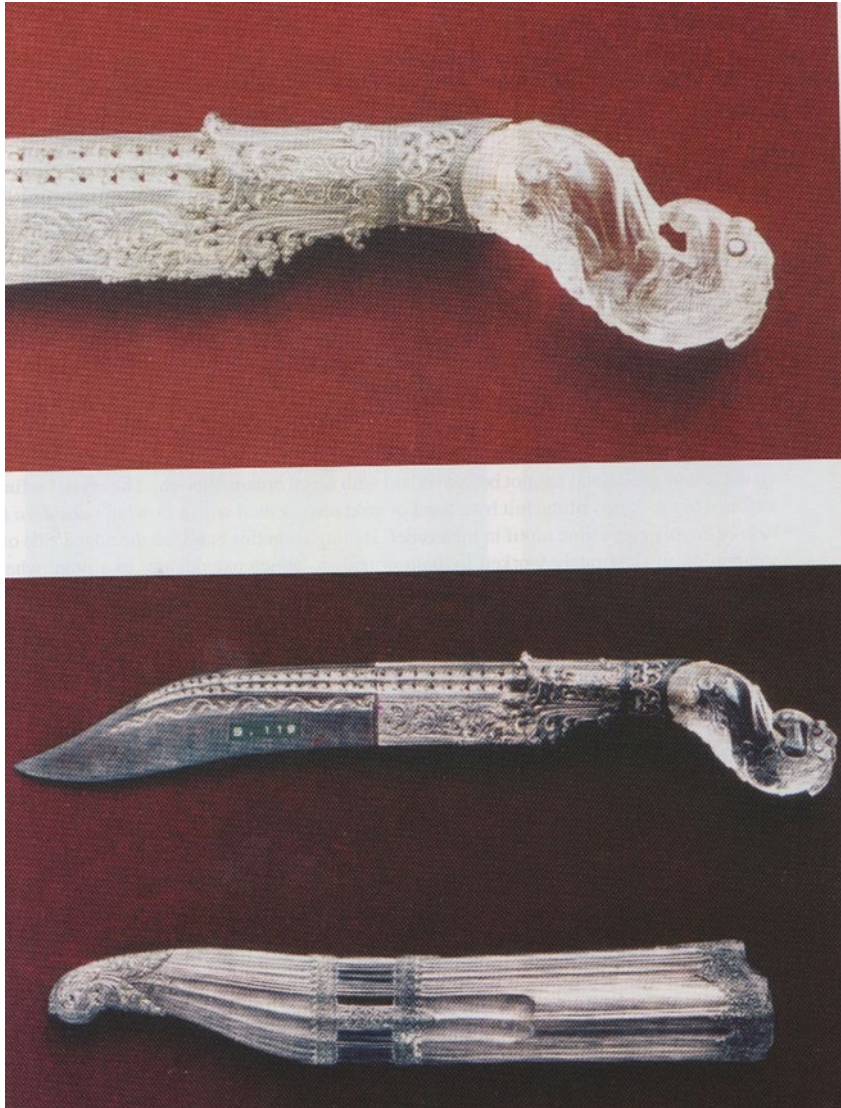
Photo 3: Royal waist knife of king Sri Vickrama Rajasinha . From: P. H. D. H De Silva and Senerath Wickramasinghe, Ancient Swords, Daggers, and Knives in Sri Lankan Museums (Colombo: Dept. of National Museums, 2007), 135.

This knife is further described as follows: 'The blade is fitted to the hilt by a circular projection of about 1cm in diameter which is visible where the crystal has not been overlaid with metal ornamentation. The crystal is further attached to the grip of the hilt by a band of gold ornaments with a flowing vakadeka (liyavela or double curved vine motif). Its scabbard is made of buffalo horn. It is heavily overlaid with sheet silver relieved by fillets. Its total length is 39.4 cm.' 12 Senarath Wickramasinghe emphasizes the similarities in decorative motives, material and shape between this royal waist knife and the pihya NG-NM-7112 that is now in the Rijksmuseum.